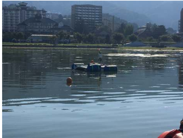
Floating platform holding Nanobubble unit

A specially designed water robot drone was placed on the bed of the lake to monitor the impact of the Nanobubbles on the sludge and data was sent back to computers and projected onto a large LED display panel, all housed on a floating observation barge. A dissolved oxygen instrument was installed below the barge.