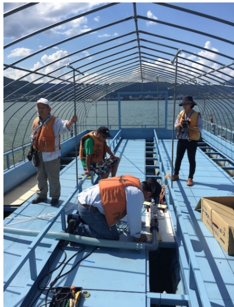
Observation barge being set upon the lake

A specially designed water robot drone was placed on the bed of the lake to monitor the impact of the Nanobubbles on the sludge and data was sent back to computers and projected onto a large LED display panel, all housed on a floating observation barge. A dissolved oxygen instrument was installed below the barge.